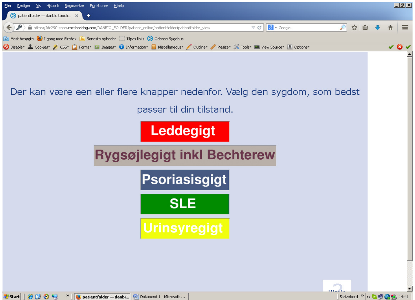
Figure 1: The patient enters his/her civil registration number and diagnosis. Subsequently, he/she answers questions relating to the disease, see the next figure.