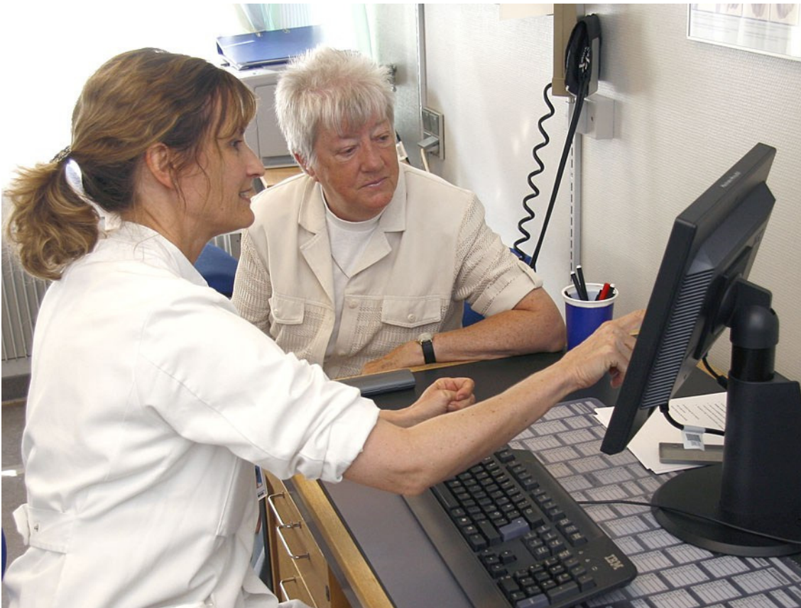
Figure 4. In the doctor's office the patient and the doctor together review the patient's answers and the doctor's own examinations, and the patient can keep track on whether the disease is treated adequately.